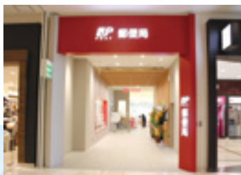
AEON MALL Makuhari New City Post Office