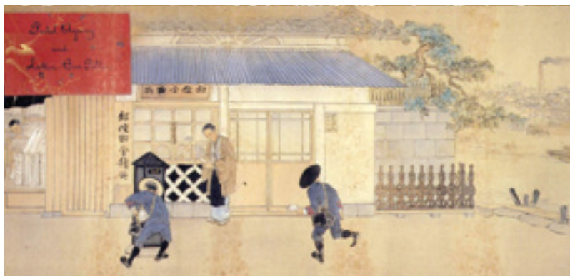
Scene of postal receipt office and postal savings deposit office, Ninth illustration, Postal operations picture scroll