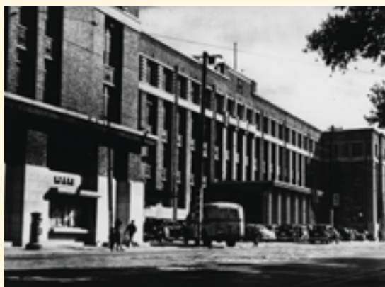
The former Ministry of Posts and Telecommunications building

1949 The Ministry of Posts and Telecommunications established.