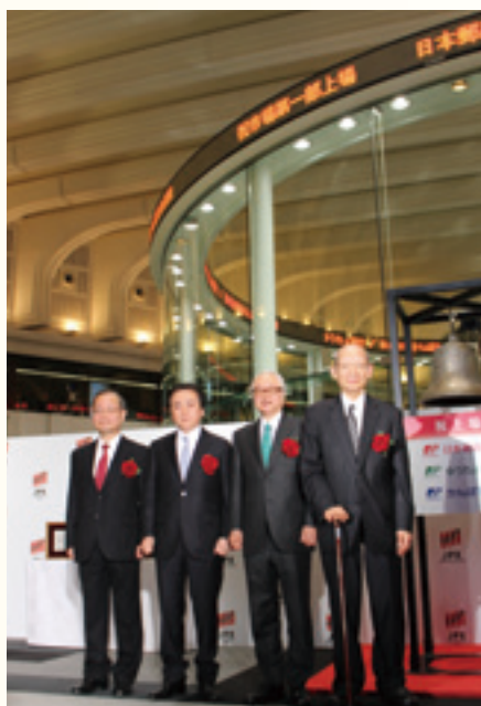
Listed on the First Section of the Tokyo Stock Exchange

Japan Post Holdings Co., Ltd., Japan Post Bank Co., Ltd. and Japan Post Insurance Co., Ltd. listed on the First Section of the Tokyo Stock Exchange.