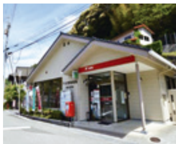
Shimo-ono Post Office