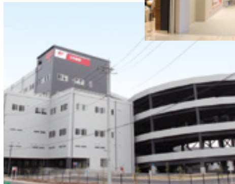
Tokyo Hokubu Post Office